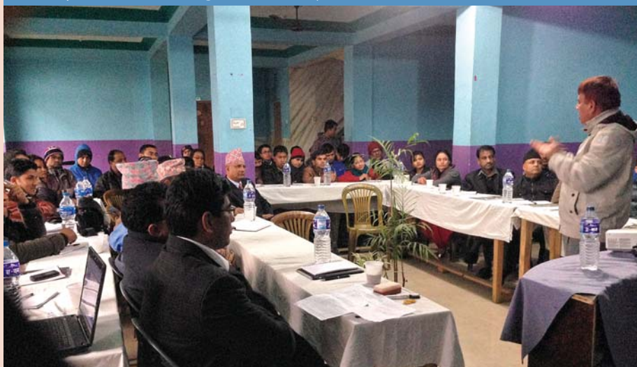
Participants at the training for economic journalists

Secretary, Joint Secretary, Under Secretaries and Section Officers of MoCS, representatives of SEJON, local trade journalists and representatives of the private sector participated in the orientation and training programme. ■