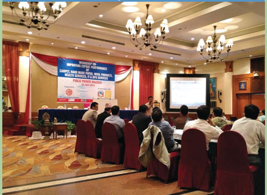
Participants in the Public-Private Dialogue

NECTRADE Project organized a Public-Private Dialogue in the form of an interactive workshop in collaboration with the Export Promotion Committee (EPC)/ FNCCI on July 26, 2013 in Kathmandu. The major objective of the interactive programme was to generate feelers, measures and thereby facilitate concerted actions on the part of the private sectors and government to enhance export competitiveness, augment investment and boost exports of five major products/services: Carpet, Health Services, Wool Products, Handmade Paper as well as IT and BPO Services. The workshop helped to review the exports as well as trade policy and NTIS interventions from the perspective of augmenting exports in general and boost five high potential exports in particular. ■