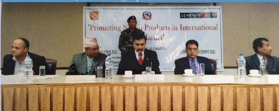
A view of the workshop on Promoting Nepalese Products in International Market

Documentaries were produced by Media Initiatives Private Limited, whose services were availed of by the Project for providing episodes to the National Radio of Nepal. Radio Nepal had aired two episodes every month for five months immediately after evening news of 7:00 pm, without commercial break. The programme acted as a tool for trade promotion, which would further add gravity towards the efforts of the NECTRADE Project through media and public information campaign. ■