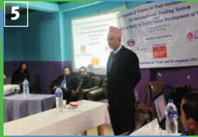
Orientation and Training for Economic Journalists