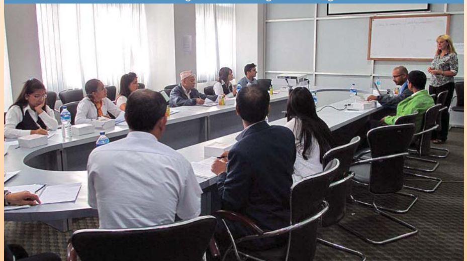
MoCS officials and staff attending one of the English Training classes

in the English training programme at the Universal Language and Computer Institute (ULCI) for one month in September 2013. It was aimed at improving the overall English language ability through unconventional and effective training mechanism, which was based on the exercise of the University of Cambridge. The training helped participants to use English correctly in day-to-day life and to be more proficient in office communication. ■