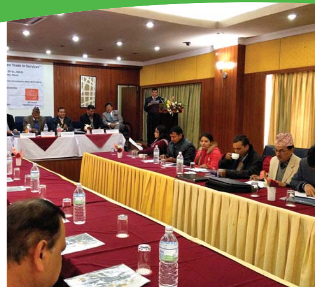
EIF Nepal Focal Point, NIU Chief and other officials at the training programme on Trade in Services