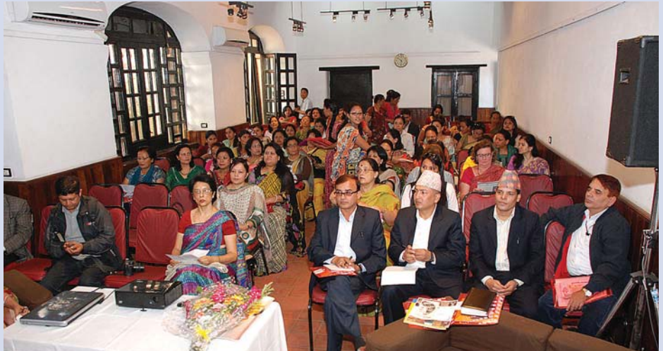
Participants at the National Consultation Workshop for Women Entrepreneurs