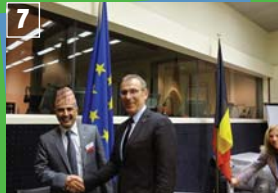
Flanders International Trade Fair