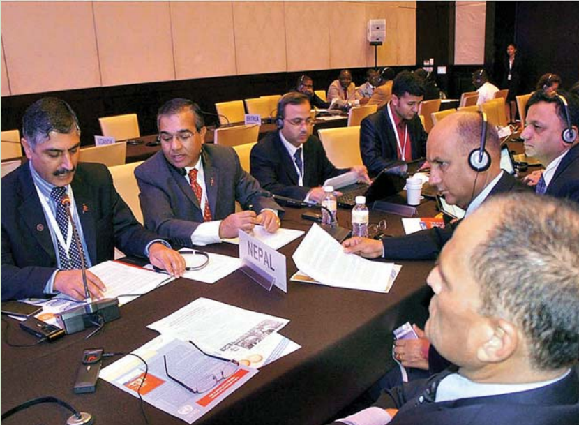
Nepalese delegation at the Bali WTO Conference