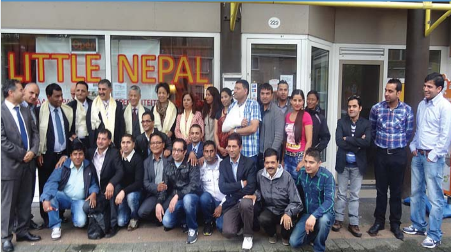
Nepalese delegation and NRNs at the interaction programme

delegation and interacting with them. H.E. Ram Mani Pokheral joined Minister Koirala's team in the programme. On the third day, Nepalese delegation met with the Development Commissioner of European Union (EU) Hon. Andris Piebalgs in Brussels, who assured continuation and extension of EU's efforts in Nepal's development. Hon. Minister S P Koirala lauded role and contribution of EU that it has been playing in the development of LDCs and Nepal. He stressed that the Trade and Economic Capacity Building (TECB) Project needs to be considered and started soon for the intervention in trade sector. Likewise, on the fourth and final day of the visit, the Nepalese delegation participated in an interaction programme in Hague organized by Non-resident Nepalese residing in Belgium and Netherlands. Minister Koirala urged NRNs to take the lead in the socio-economic transformation of Nepal through transfer of knowledge and technology and bringing in foreign investment into the country. ■