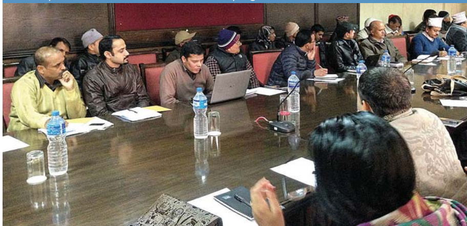
Participants at the local-level interaction programme