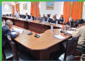
EIF-Nepal NSC meetings: hat trick in a single year!