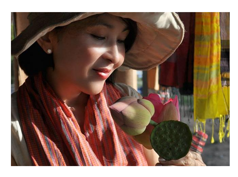
Silk exquisite elegance

Sentosa Silk is a brand that expresses Cambodian elegance and high value silk craftsmanship. Products are 100% hand-woven silk, inspired by women and designed for women.