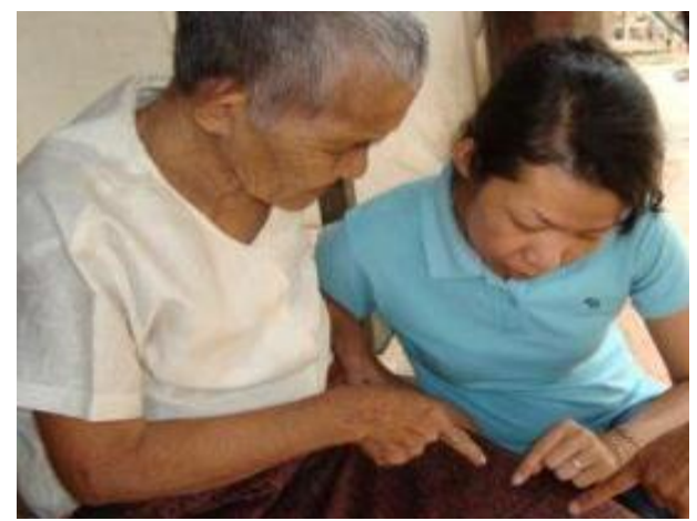
Nature is our inspiration, people our motivation