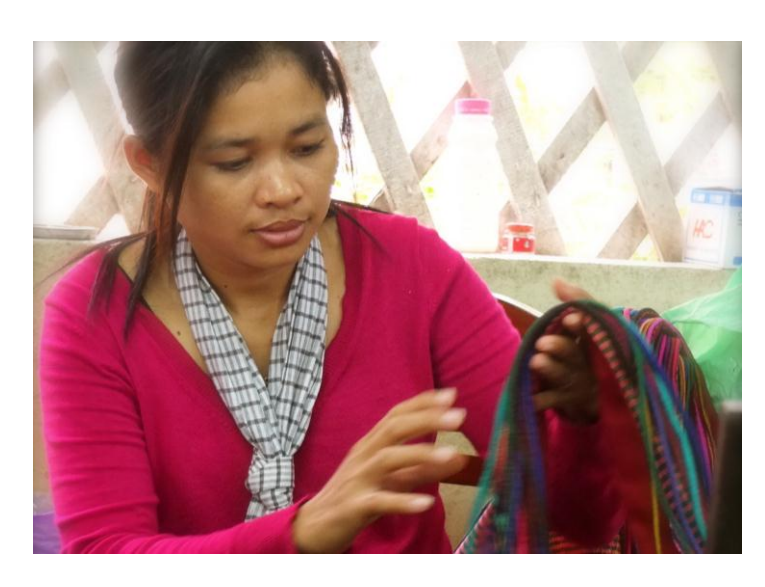
Colors for a better Life

Provide jobs and fair wages to village home-based and disabled workers