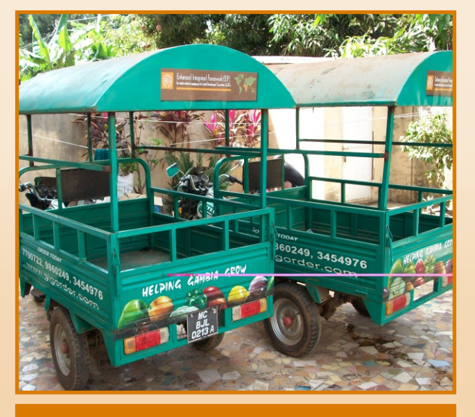
Motorbycycles were bought for to aid in the distribution of horticulture produce

The institutions supported by the EIF Programme include Fisheries Department, Ministry of Justice, Food Safety and Quality Authority, Gambia Chamber of Commerce and Industry, Gambia Investment and Export Promotion Agency