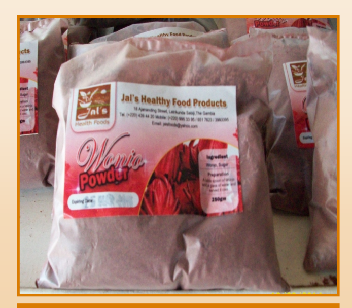
Support from EIF to local food processor Jal Yassin's Enterprise

On November 13th the National Steering Committee (NSC) in its quarterly meeting to reviewed and approved five sub grantee proposals for funding support. The proposals address trade related activities in Programme Accelerated Growth