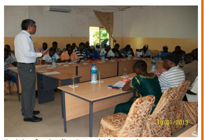
Training for Quality Control of Groundnuts

The meeting attended by nine members of the quality taskforce, the national consultants and international consultant enabled the members to have an input and contribute to the overall quality of the three sectors targeted by the project — Sesame, Cashew and Groundnut. The upcoming Quality Control training for Groundnuts and HACCP training was also discussed and the TOR for participants reviewed.